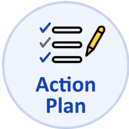
Action Plan Template

Please refer to the "Action Plan Template"